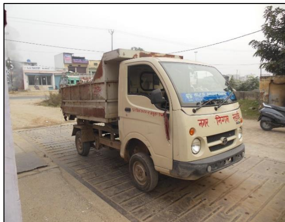
Table 1: Vehicle Carrying MSW