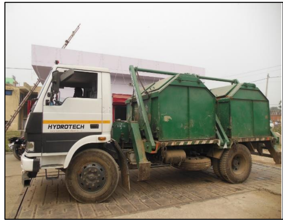
Fig 2b: Dumping Vehicles