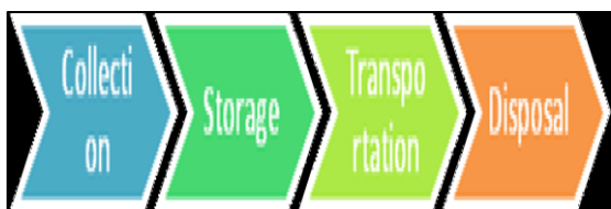
Fig 1: MSW Methodology used in Roorkee City

Door to door primary collection by engaging private sweepers. Waste is mostly collected through community bins/containers and road sweeping. Sweepers and sanitary workers engaged by the Roorkee Nagar Palika Parishad (RNPP) sweep the streets. They accumulated the collected waste into small heaps and subsequently loaded manually or mechanically onto the community containers/bins or directly loaded onto the solid waste transportation vehicles for onward transportation to the disposal site. RNPP presently utilizes the vehicles and equipment for transportation of solid waste.